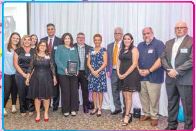
The Non-Physician Award of Appreciation was presented to Lee Health System's Respiratory Therapists