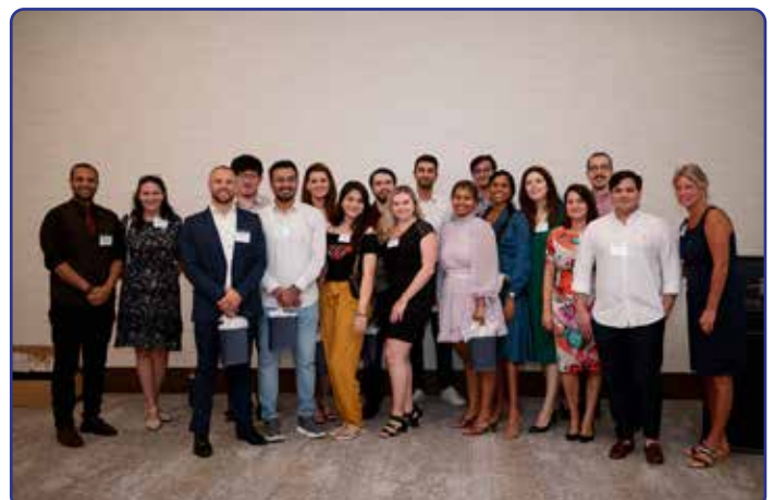
Some members from last year's classes, many of whom are now practicing medicine in Lee County, attended the reception to show their support