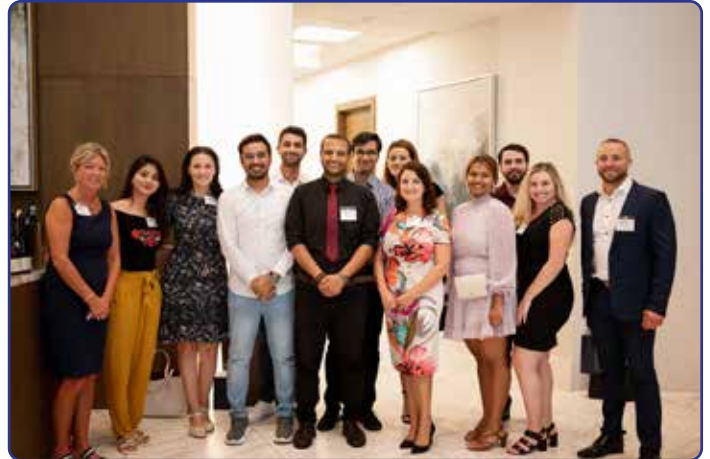
2023 Internal Medicine Residency Class

LCMS hosted its annual Residents Reception on Thursday, July 6, 2023, hosted by FineMark National Bank & Trust. In addition to welcoming a new class of eager-to-learn internal medicine and family medicine resident physicians, LCMS members and guests enjoyed lots of networking.