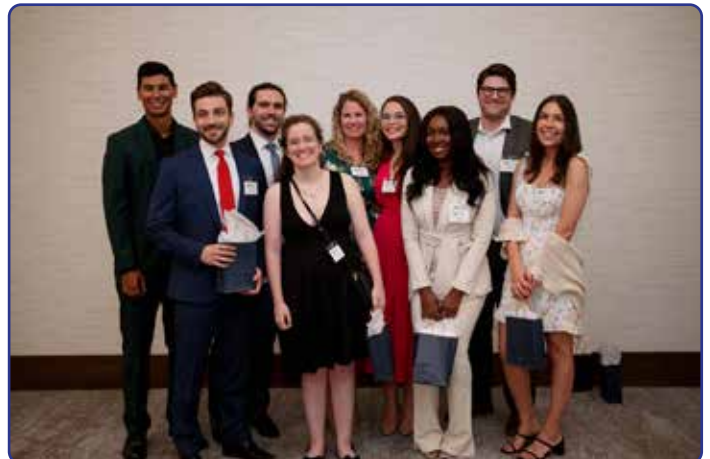
2023 Family Medicine Residency Class