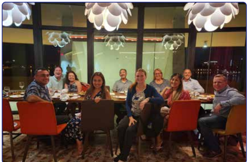
After a long day of meetings at the FMA Annual Conference, your 2023 FMA Delegates enjoyed a very nice, well-deserved dinner.