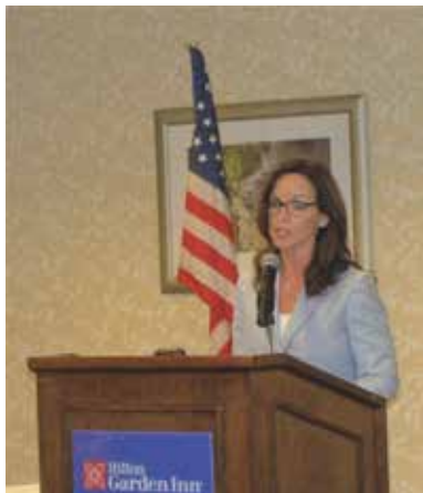
Senator Benacquisto R-30