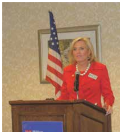
Rep. Heather Fitzenhagen R-78