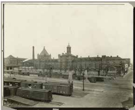
Maryland Penitentiary, Baltimore

The warden was exceedingly proud of his expertise and as this was the last hanging, he kept the hangman's knot as a trophy but one day it "disappeared" from his office. Furiously he searched the prison but failed to retrieve his trophy!